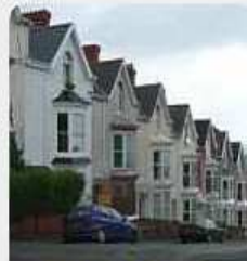
Private Rented Accommodation