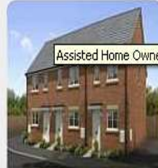
Assisted Home Ownership