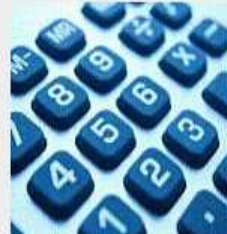
Waiting time calculator